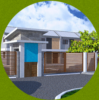
Guard House and Gate

📍 Brgy. Tatala, Binangonan, Province of Rizal