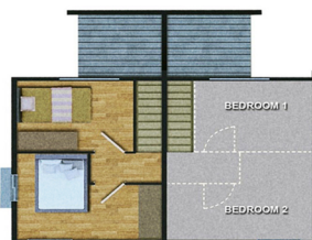
SECOND FLOOR PLAN Typical Unit